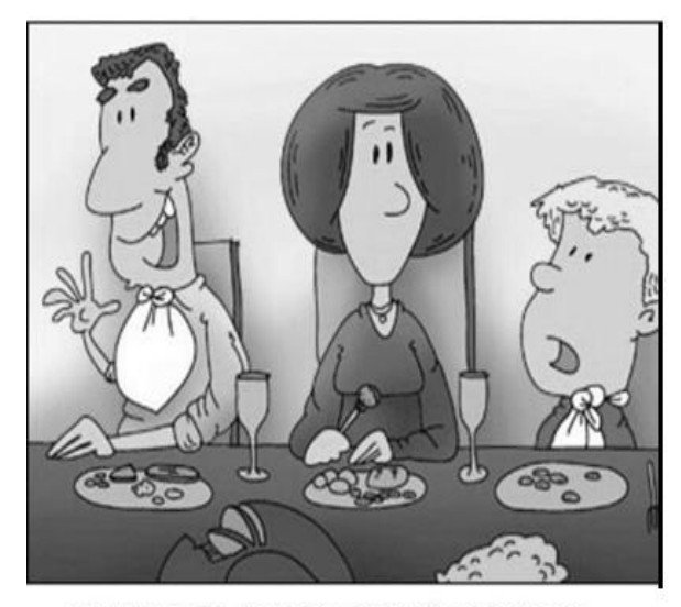
I WOULD BE ABLE TO GIVE A LOT MORE THANKS IF I DIDN'T HAVE TO FINISH OFF THESE LIMA BEANS